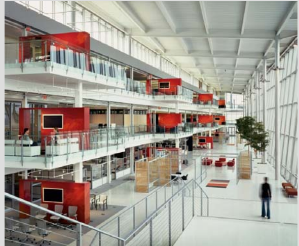
Haworth global headquarters Holland, Michigan